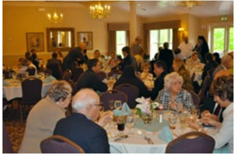
Scenes from the Ordination Banquet.